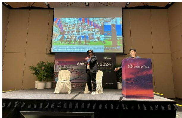
Presentation of AR Attraction, “Ultra Investigators,” on Side Stage