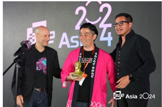
Receiving “Auggie Awards”

is a globally recognized conference and exhibition focused on AR, VR, and wearable technologies. Organized by nonprofit organization AugmentedReality.org since 2010, its mission is to drive human progress through advancing AR and VR technologies. Forbes has called it “XR’s 1 Most Essential Conference,” bringing together outstanding XR experts, investors, developers, media, and companies. This year’s AWE Asia 2024 attracted over 1,000 participants from 34 countries and regions.