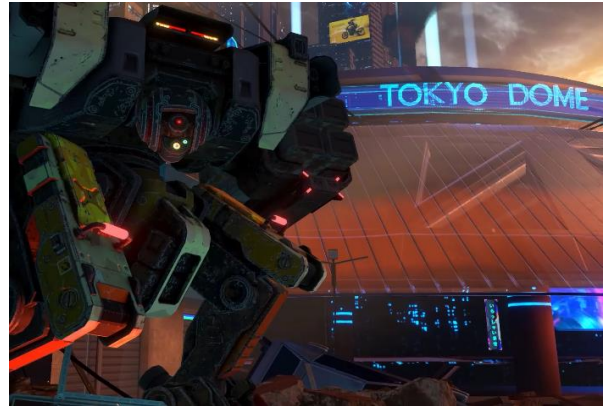
Image of XR Attraction Video

120 people participated over two days, with many questions raised by attendees.