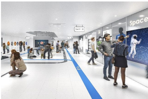
Interior Image of the New Space Experience Facility "Space Travelium TeNQ"

Facility Information: https://www.tokyo-dome.co.jp/tenq/