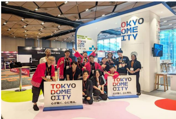
Tokyo Dome Team at Exhibition Booth