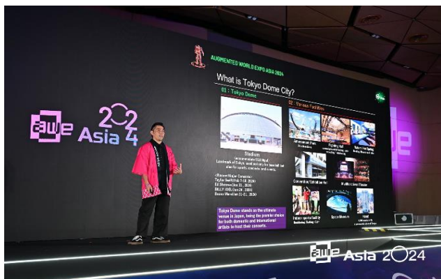
Speech on Main Stage: XR Initiatives and Products at TOKYO DOME CITY

Tokyo Dome Corporation launched the “enXross” project in 2023 to deliver new value and heart-moving experiences through entertainment and innovation, utilizing digital technology to create a new digital economy and enhance customer experiences. At AWE Asia, we held a demo session of the prototype “Ultra Investigators”, which won Best Award at “enXross HACKATHON” held in July 2024. This next-generation attraction allows participants to take on various missions using AR glasses and NFC (near-field communication) cards. It was praised for the excitement and engagement of collecting cards and inserting them into a gadget, as well as for its flexibility in freely adapting different IPs.